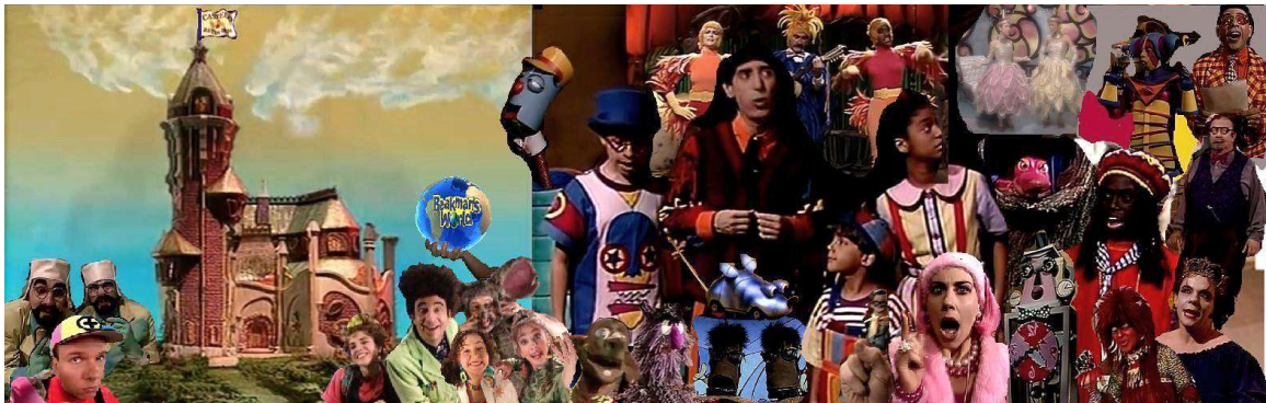
Originally posted in "Castelo Rá-Tim-Bum, Entusiastas" on April 18, 2015.